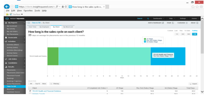
Stage 3 - Interview & selection